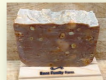
Cinnamon Orange Castile