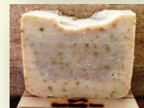
Green Tea Sand